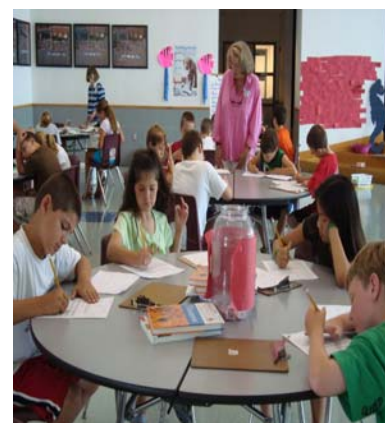
Medway students were hard at work at Memorial School this summer at a Writing Workshop sponsored by an MFE grant.